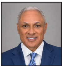
Mike Espy ALI Fellow